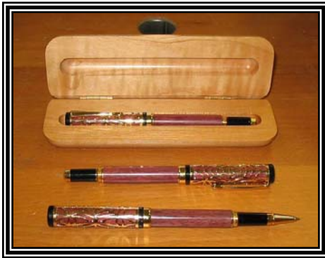
← Larry Dunklee: 3 pens for RI Purple Heart recipients