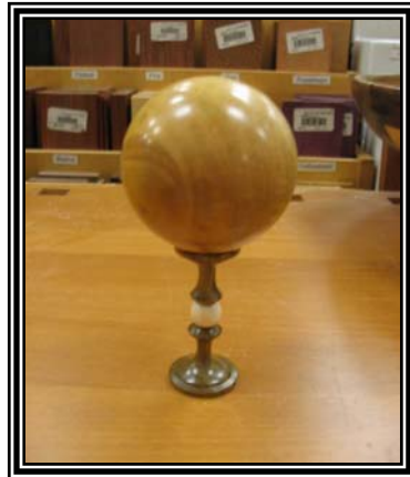
← A terrific globe on a threaded pedestal purchased by Angelo Iafate at the 2004 Symposium.