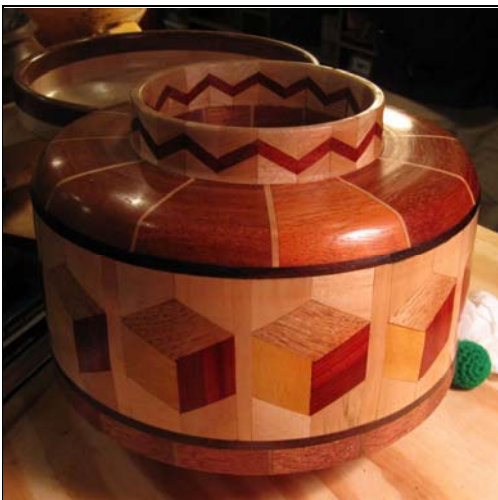
Paul Tavares - 8" segmented bowl using Mahogany, Maple, Paddock, Butternut, and Yellow-Heart