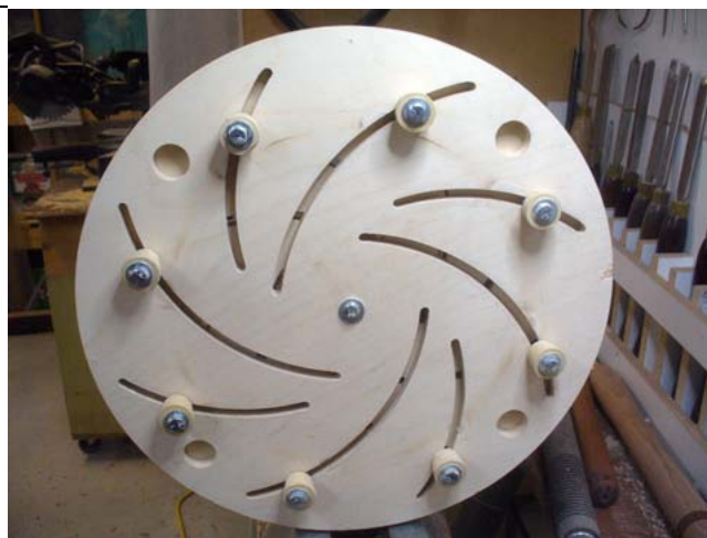
Donna Parrilo built a Longworth chuck. http://www.woodworkersguide.com/2010/10/17/how-to-make-a-longworth-chuck/ is a link to the instructions used