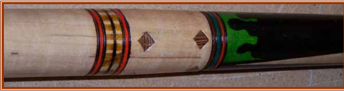
Close Up's of the details on Greg's pool cue.