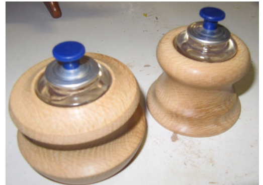
Craig Verrastro - Holders for small oil candles. The November Oak cracked so I made two smaller turnings instead of one larger one.

Rich Lemieux - what I did was split the thickness of the blank and then turn two shallow bowl shapes, one with a rabbet at the rim and the other with a flange. The flange bowl was inverted and glued to the other forming a type of hollow form w/ concave exterior. This is the section that is stained to highlight the natural inner grain. Possible use--dried flowers, a tea light holder.