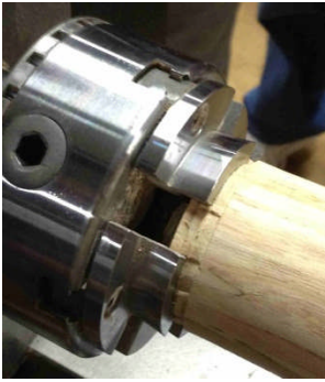
Clamping on selected tenon