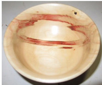
Craig Verrastro – 6” box Elder bowl