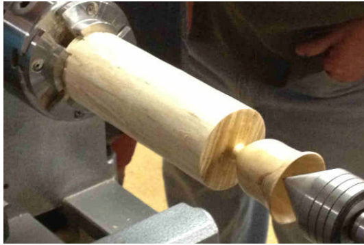
Start of next section