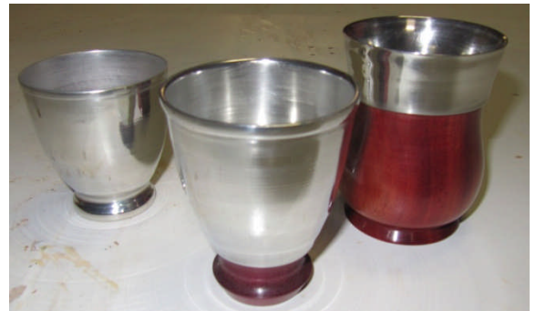
David Hanssen - The leftmost cup is entirely of Pewter, with an outer layer wrapped around the inner part. The middle cup has a Purpleheart base supporting the internal cup. I wrapped the outside layer over the wooden base and then cut the bottom away to expose the wood. The cup on the right is made of Bloodwood with a Pewter interior cup wrapped back over the top of the Bloodwood cup.