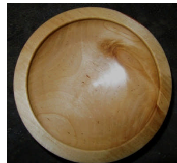
Jeff Mee showed 3 bowls - Walnut with beeswax finish, Catalpa wood, and Maple.