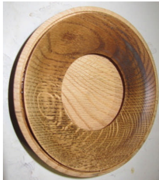
Rich Lemieux – two section bowl