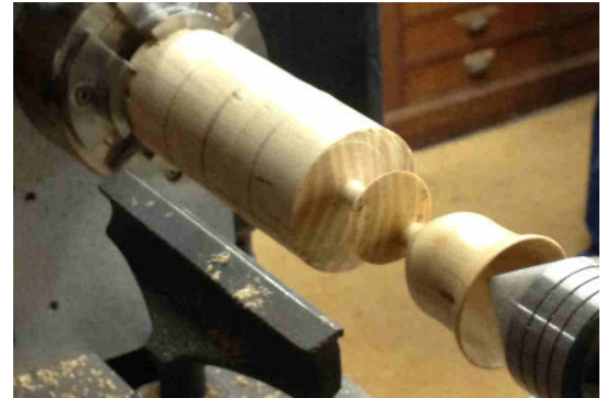
Next section has been turned

The second method uses a straight 1-3/8" tenon and a holding block with a 1-3/8" hole bored in it. The holding block is then held between two opposing jaws with the other two jaws are removed. Sliding the block left or right creates the offset and rotating the blank in the bored hole creates indexing. Two screws are inserted in the block to lock the blank into position.