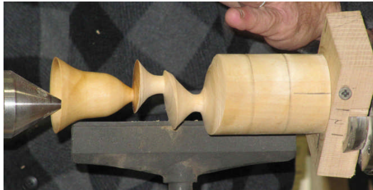
2 Screws are used to lock the blank into the holding block

As a safety precaution, the live cone center of the tailstock is "in", but not touching the end of the blank so that, in the event of a "catch", the blank might not be thrown at the turner or spectators.