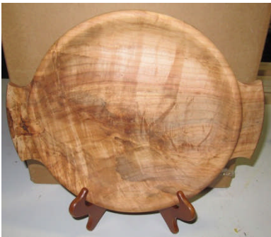
Joe Doran – Silver Maple platter