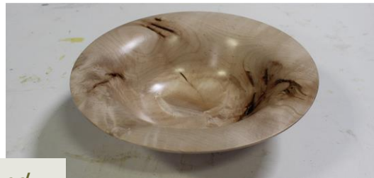
Maple bowl with bark inclusions and renaissance wax finish