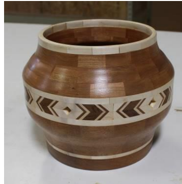
Spalted Maple vase, Ambrosia Maple bowl, and segmented vessel of various unknown scrap wood species.