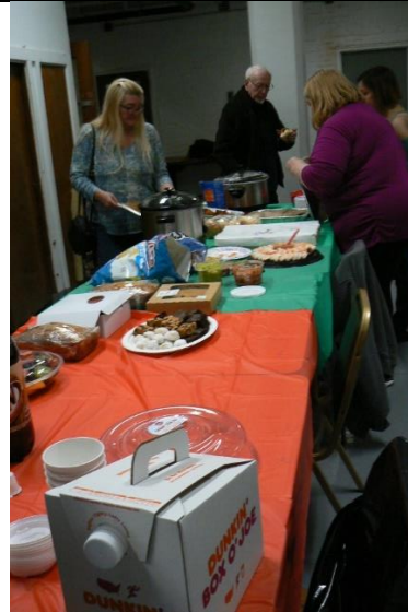
Thanks to all who produced this great food table for our meeting and get together